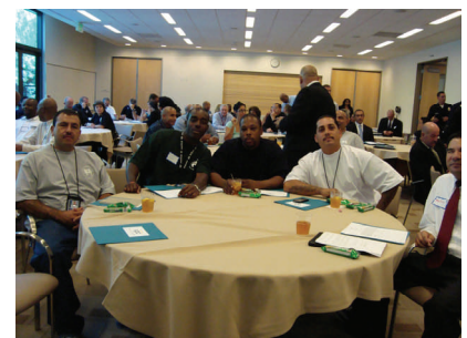
Gang Intervention Workers at a VPC hosted event with Hospital Administrators and LAPD.

partner in this process, promoting a formal relationship, coupled with training for intervention workers regarding the unique aspects of working in and around a hospital or trauma center.