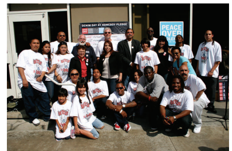
Youth-led events sponsored by VPC Challenge Grants

their peers regarding various forms of violence and how each has responsibility for reducing the damages to our communities.