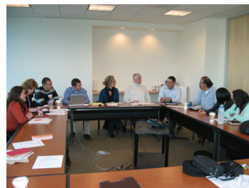
The Steering Committee discussing upcoming VPC events

In addition to new officers, the Steering Committee is wrapping up a set of "Network Planning Priorities" that will help define and guide the work of the VPC over the next three years.